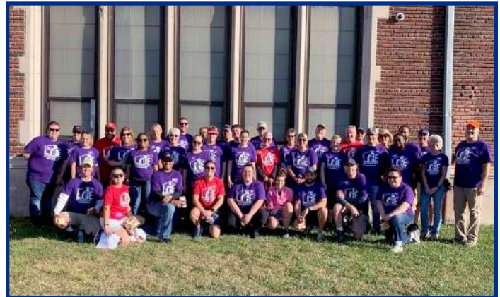
Employees volunteer with Life Remodeled, restoring abandoned homes and cleaning up neighborhoods in Detroit.

AMERISURE CHARITABLE FOUNDATION CONTRIBUTIONS TOALED